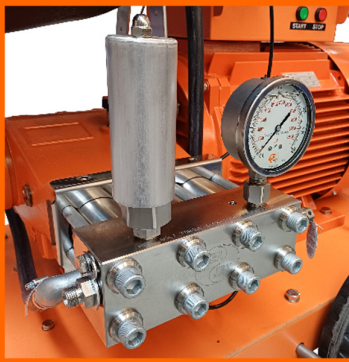
Stainless steel pump-head. Integrated safety valve / rupture disc.