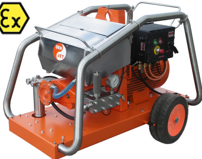
CEX40 ATEX compliant EEx Unit for Zone II