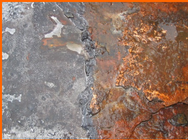
Surface - Ultra Impact Nozzle