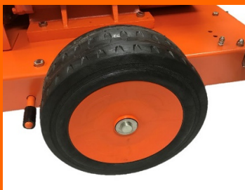
Stainless steel frame with built in brake and solid wheels.