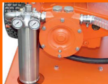
Integrated booster pump & filter systems w. low pressure shut down.