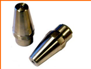
Single jet Rotating Nozzle