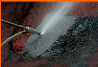
Surface – Sand blasting