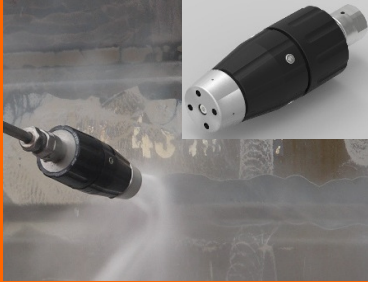
Ultra Impact Rotating Nozzle