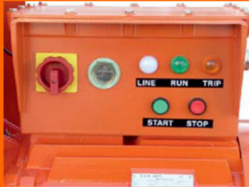
Electrical box with main switch, overload relay & hour meter.