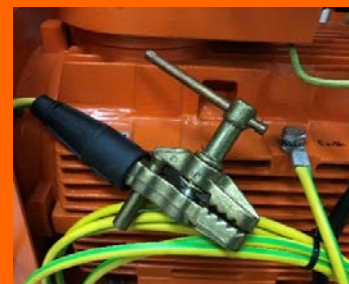
Earth Cable with Clamp.