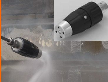
Ultra Impact Rotating Nozzle