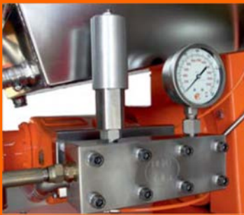
Stainless steel pump-head. Integrated unloader valve.