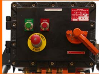
EEx electrical box with main switch, star delta starter & overload relay.