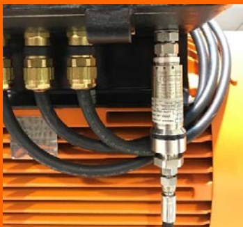
Cut-off switch for low inlet water