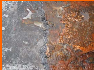
Surface - Ultra Impact Nozzle