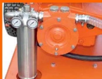
Integrated booster pump & filter systems w. low pressure shut down.