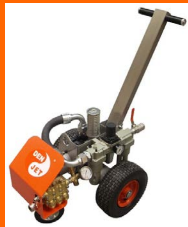
CA12-250 Air Powered Blaster Atex compliant Atex II cat.2G&D T5