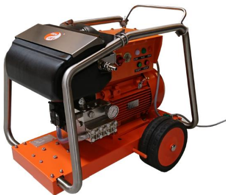
CE 20 Series