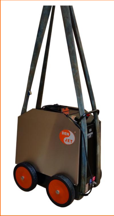
Lifting hot box