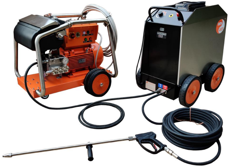
HOT BOX with CE20-500 and dry shut gun