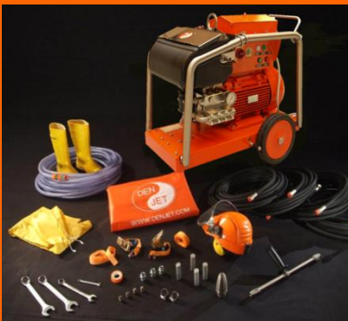
Plug & Play Package