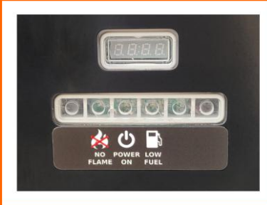
LED display and working hours