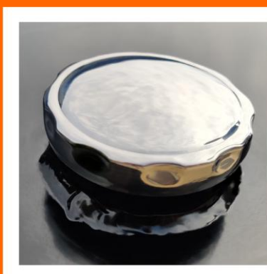
Stainless steel fuel cap