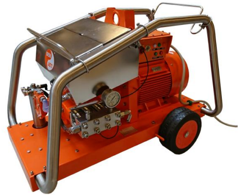
CE 40 Series