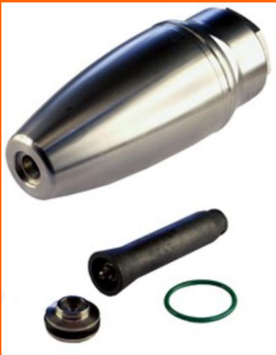
Single jet Rotating Nozzle